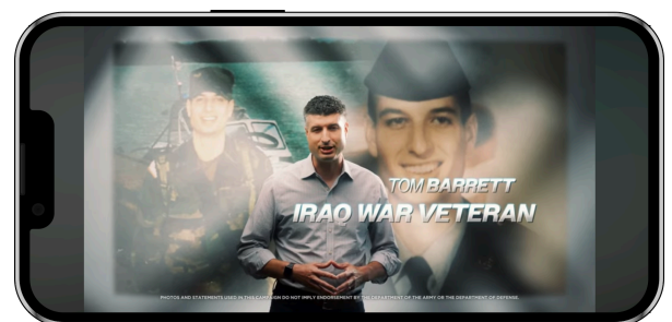
Click phone to play video.